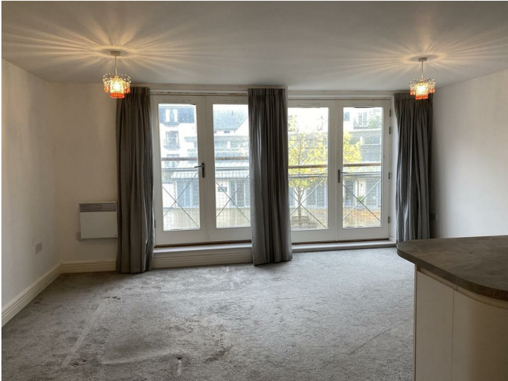
Lounge 9'1" x 12'7" (2.769 x 3.851)