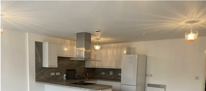
Kitchen 7'6" x 9'3" (2.303 x 2.835)